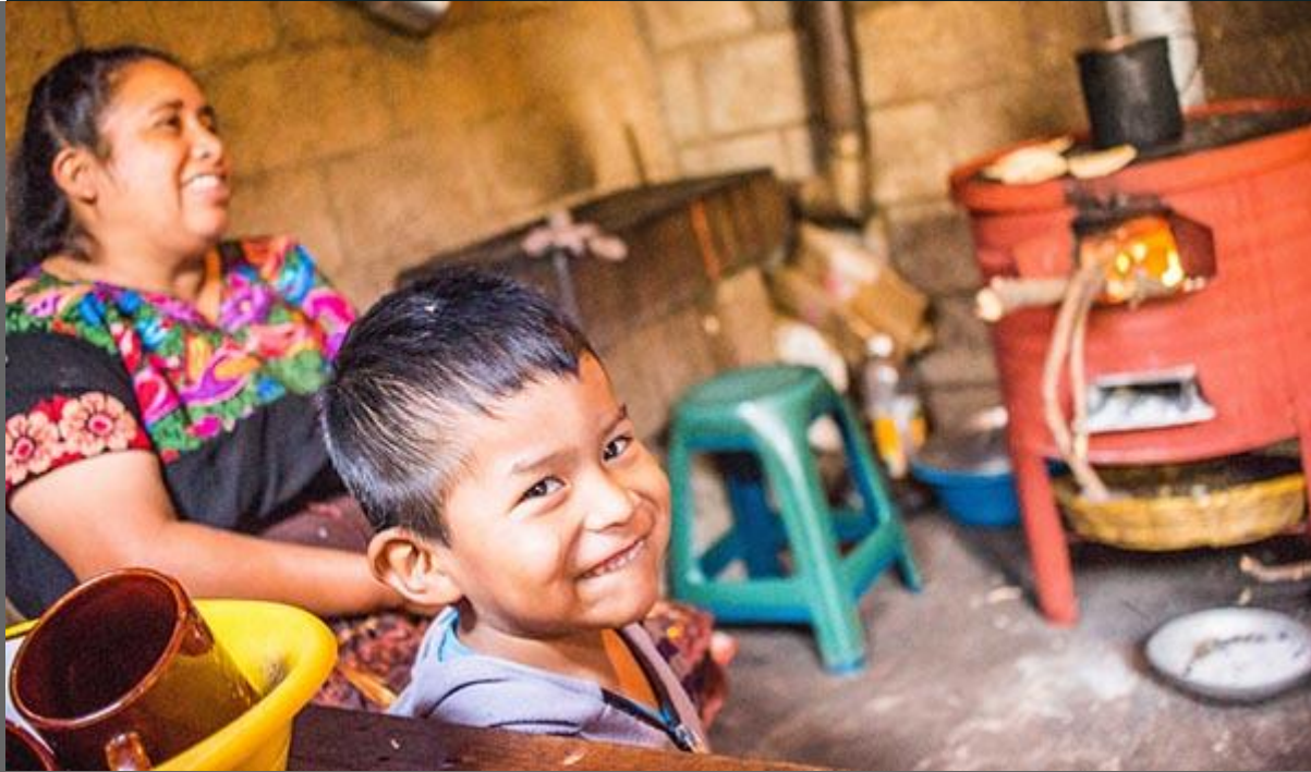
A boy smiles as his breakfast cooks on a new cookstove his family recently bought as part of a behavior change communications campaign in Guatemala.