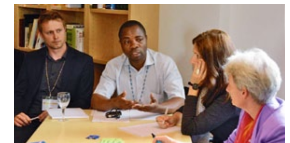
Workshop participants discussing the emerging opportunities in cooking fuels and in changing cooking habits.

Participants called upon the Global Alliance and its research partners to commission the development of a toolkit to understand and incorporate user behaviour in the design of appropriate household energy interventions. The toolkit could be used by stove designers, entrepreneurs and policy-makers in various contexts.