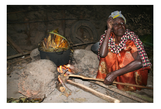
Fig. 1. Woman cooking on a three-stone fire, Uganda.