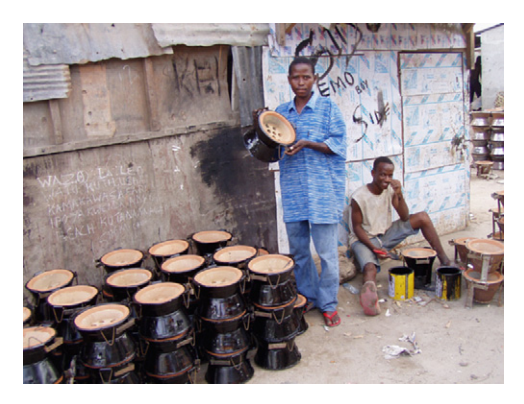
Fig. 2. Charcoal stove ( Kenyan Jiko ), made of clay/metal, artisanal production, Kenya.