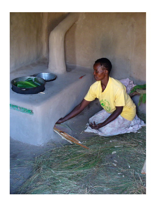
Fig. 5. Woman cooking on a Rocket Lorena, Uganda.

In rural areas, the project trains trainers from different local NGOs who are then training local artisans to become stove builders. They built the inbuilt stoves on demand, and are paid by the households requesting the service. A monitoring system guarantees that only good quality stoves are installed. Metal rocket stoves and portable rocket stoves made of clay are produced on stock. On the demand side, substantial awareness campaigns are conducted in order to increase orders for stoves.