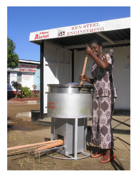
Fig. 3. Wood stove ( Institutional Rocket Stove), made of metal and insulation material, artisanal production, Malawi.

Based on this lesson learnt, the last years have seen a change in the approach of promoting efficient stoves. Commercialisation is considered to be more successful for sustainable stove dissemination. Professional stove producers have more routine in building stoves according to certain design standards, and because they earn money running stove businesses, they have a strong interest in selling their products.