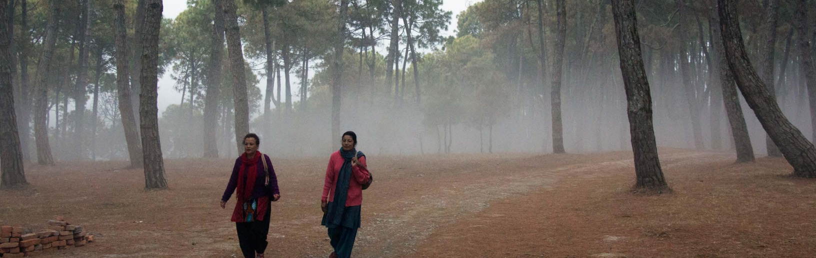
Image 6. Two Nepalese women walking through a forest.