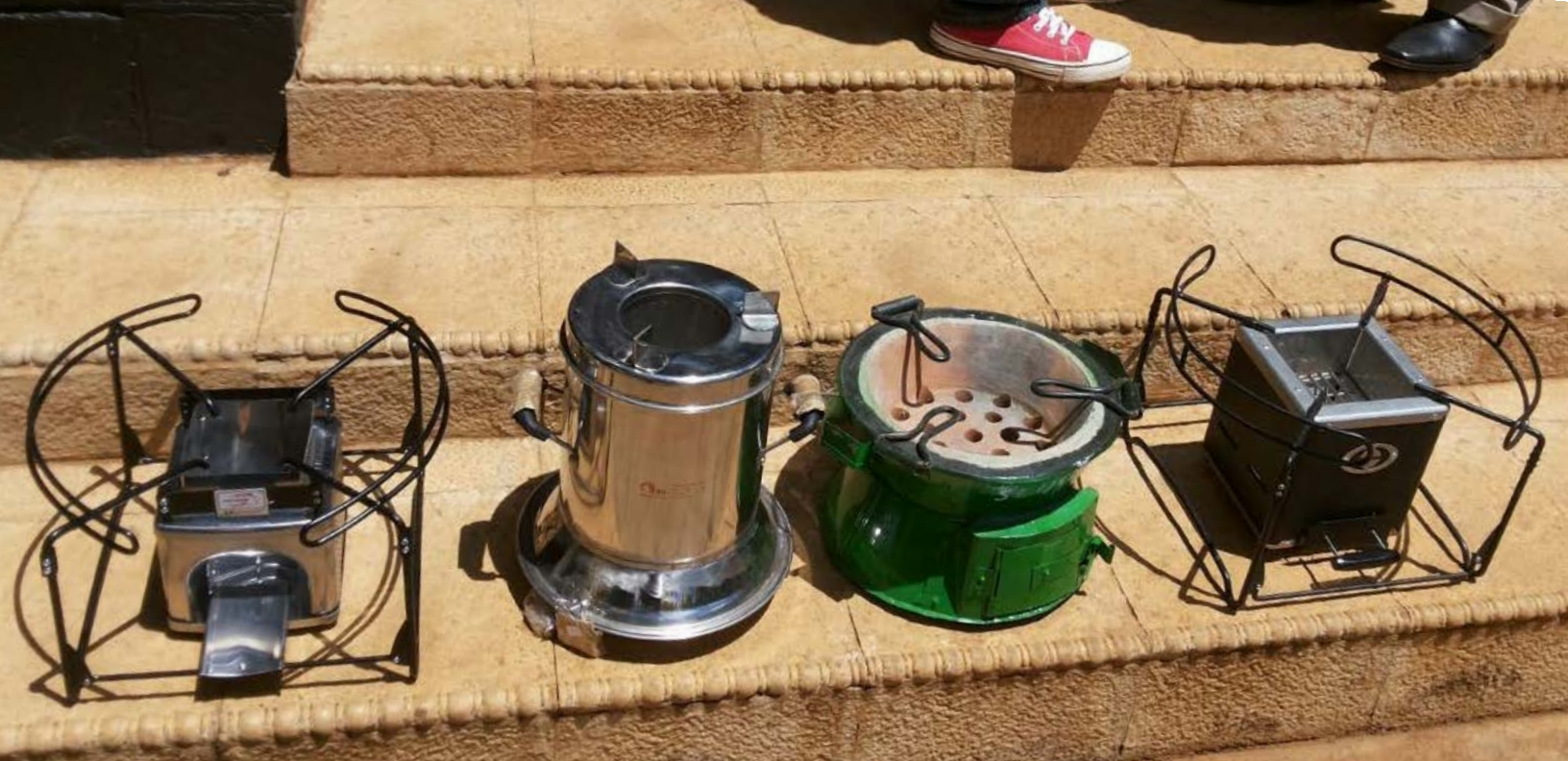
Image 3. A variety of biomass cookstoves on display in Kenya.