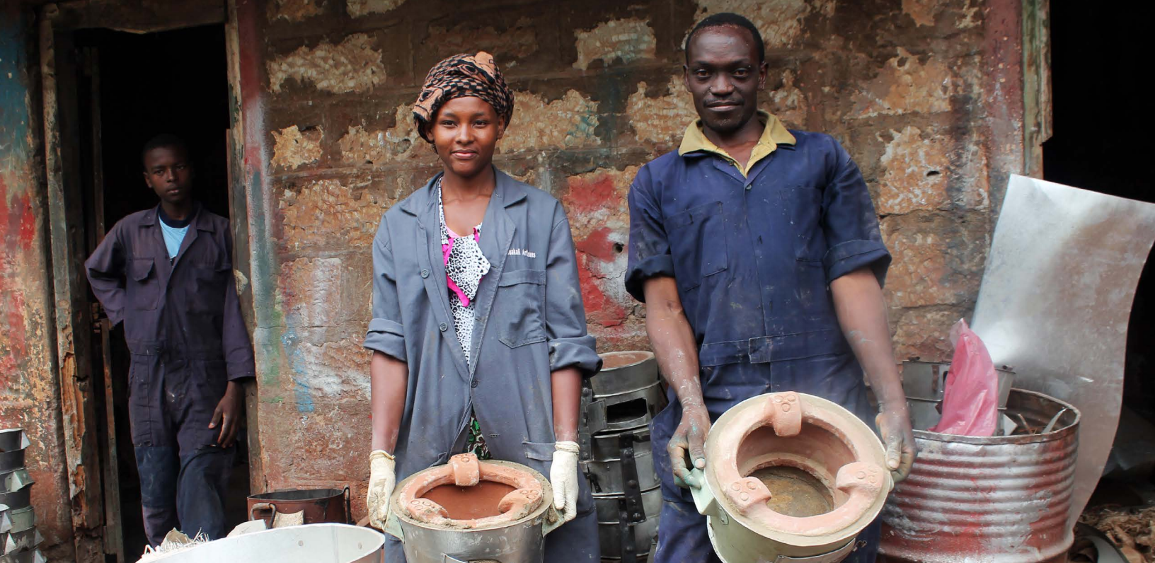
Image 4. Kenyan Jiko cookstove manufacturers.