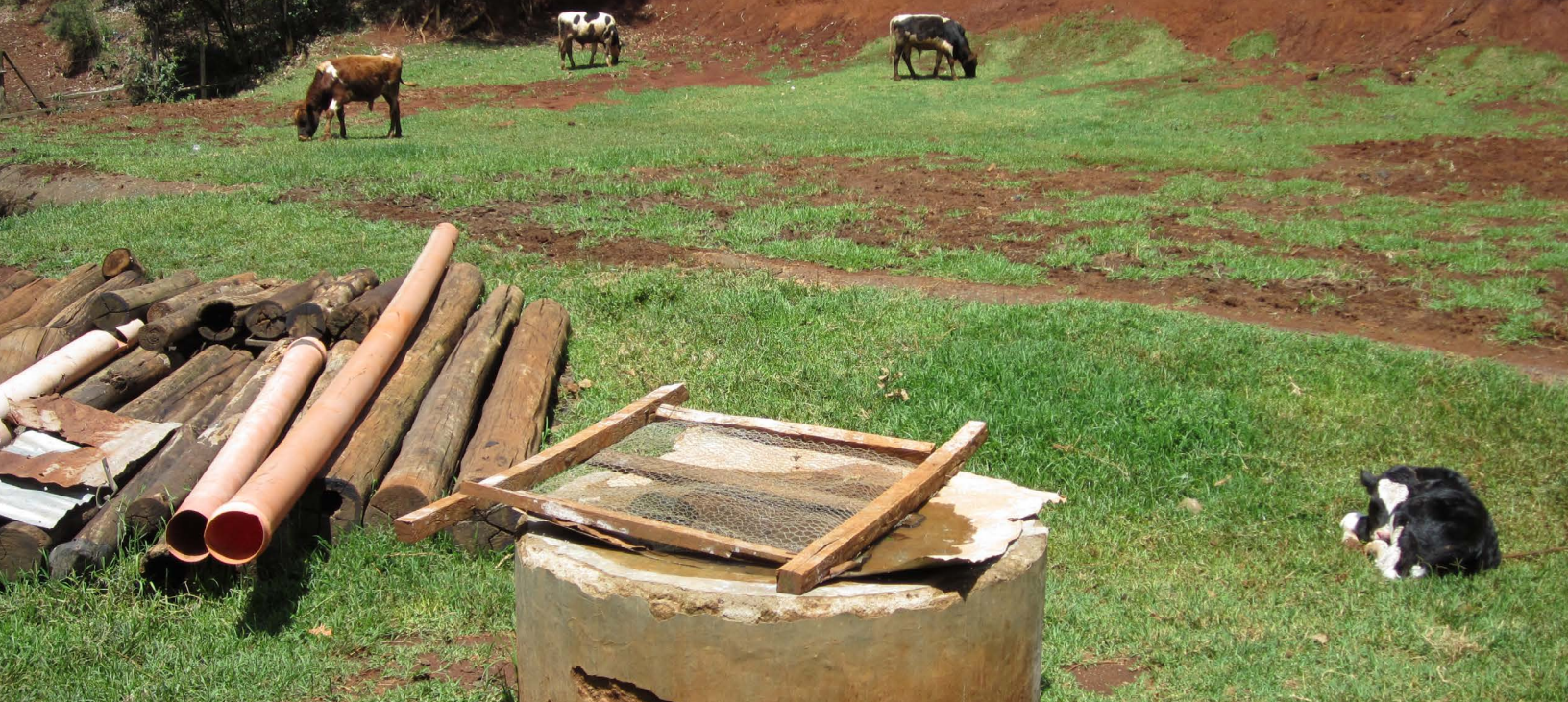
Image 5. Biogas systems, like the Kenyan one pictured here, require waste from cattle to produce energy.