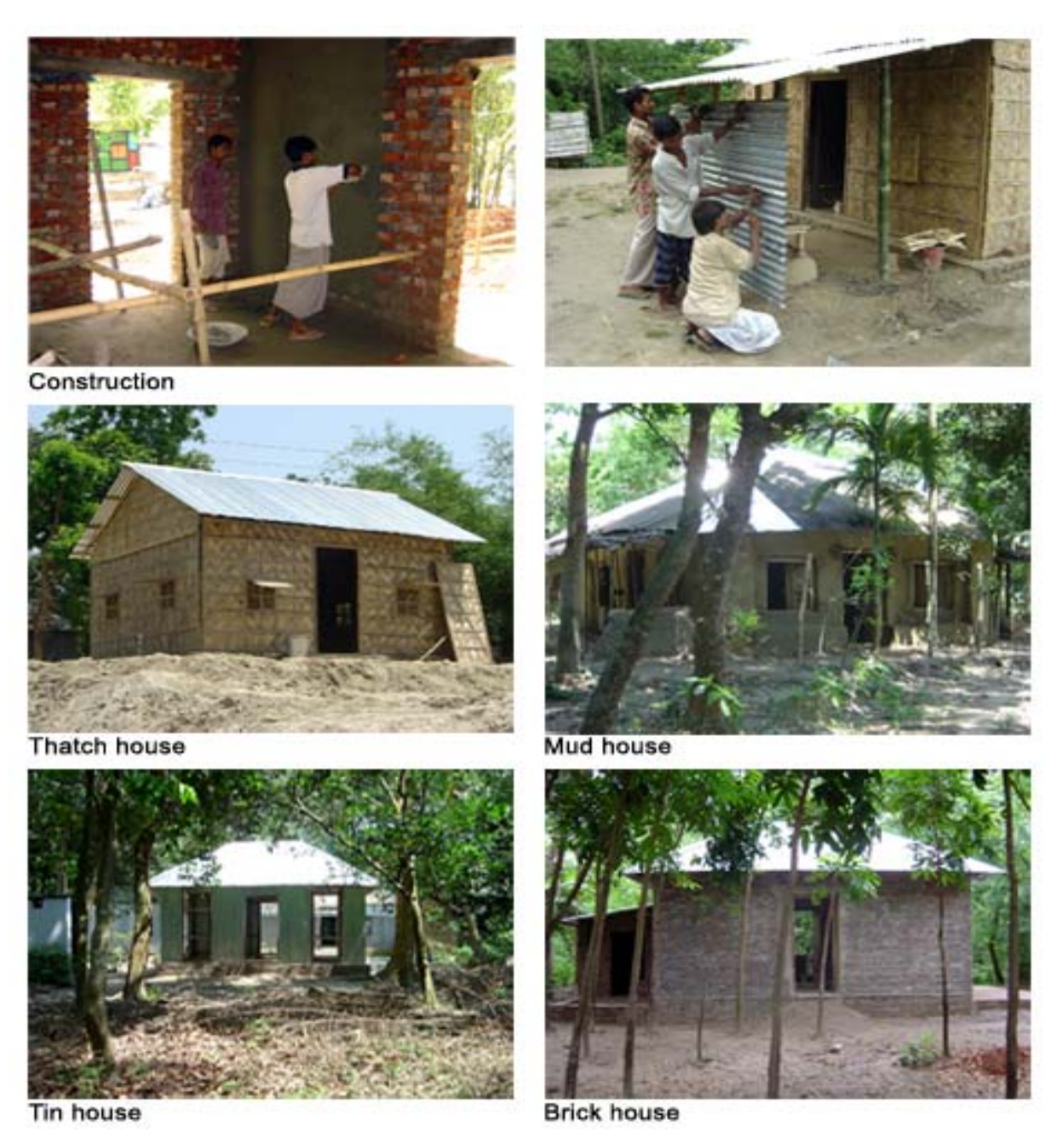
Figure 2: Houses for Controlled Experiments

Local workers at each site were hired to construct experimental houses that are indistinguishable from structures actually used by poor families in the area, using standard local building practices. The four sets of houses built had walls made of thatch, mud, corrugated iron (tin) and bricks (henceforth referred to as Thatch, Mud, Tin and Brick houses, respectively). The walls of each house were permanent, but roofing materials were altered to produce a variety of standard combinations. In the final experimental set, the Thatch house had tin and thatch roofs; the Mud, Tin and Brick houses had tin roofs, and in a later experimental stage the Brick house roof was changed to concrete. Prevailing winds in the region are from south to north in the summer and north to south in the winter, so the axes of the houses were aligned in the north-south direction to capture varying wind conditions. Houses were furnished to create life settings for the experiments.