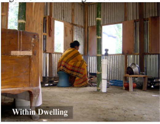
Figure 3: Monitoring Indoor Air in Different Kitchens

Provisions were made for cooking fuel combustion in four configurations that simulate common cooking arrangements: inside the house (within-dwelling); in a space attached to it (attached kitchen); in a space enclosed by walls and a roof at a little distance from the house (detached kitchen); and in the open air. The wall materials of attached and detached kitchens varied among thatch, mud, tin and brick, while the roofs varied among thatch, tin and concrete. The experiments also allowed for turning on a ceiling fan in the living space. Experimental combustion used diverse energy sources: clean fuels (kerosene, LPG), wood, cow dung and other biomass fuels (rice husks, jute etc.). Table 1 summarizes the distribution of conducted experiments. Combinations of cooking arrangements, kitchen configurations and fuel were restricted to cases generally observed in Bangladesh<sup>5</sup>.