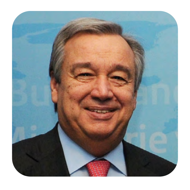
António Guterres Secretary-General, United Nations; former Prime Minister, Portugal