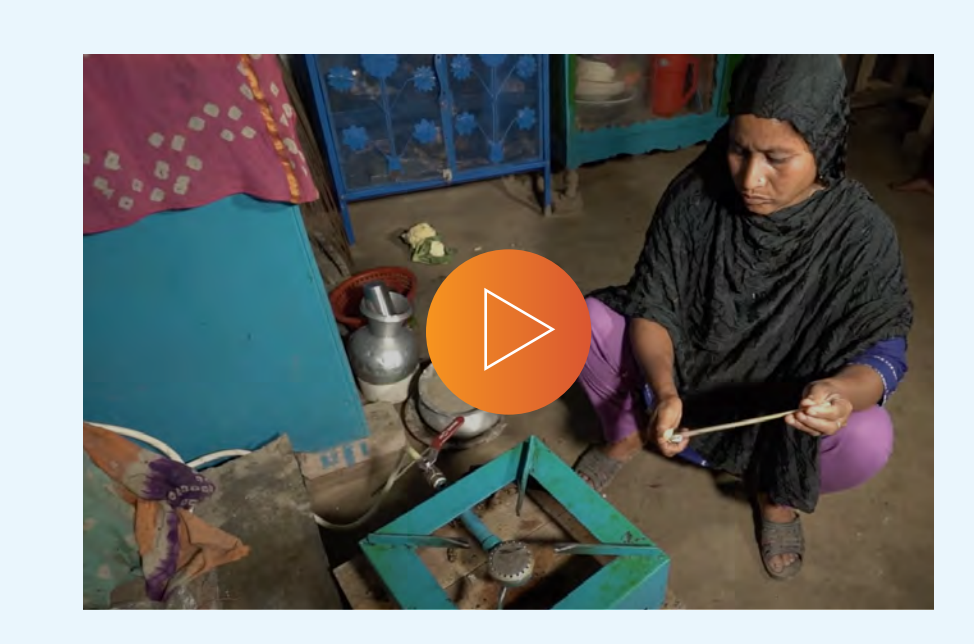
Learn more from company leaders about their experiences with CCA's Venture Catalyst program

Catalyst program, which has now partnered with 27 companies to complete 83 projects in 19 countries, CCA launched a Venture Accelerator program to support small- and medium-sized companies, with the inaugural cohort focused on carbon finance in West Africa. CCA also held its first Innovation Challenge with the United Nations Capital Development Fund (UNCDF), dedicated to digital solutions.