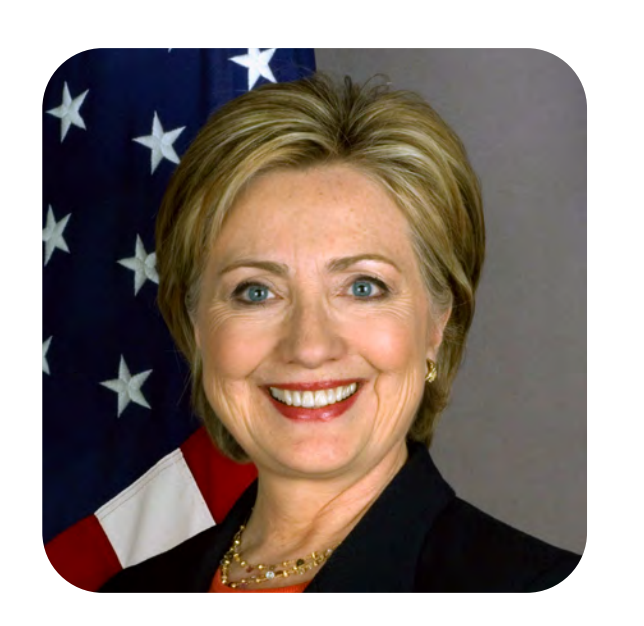
Hillary Rodham Clinton Former Secretary of State, United States